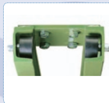
cod. 9980069000 - Veiligheidsstop - Running beam end stop - Tampon de butée